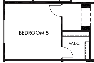
OPT. BEDROOM 5