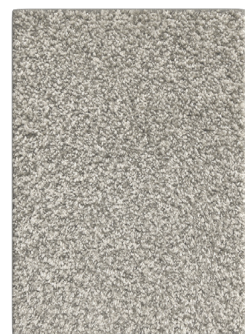
CARPET Raise the Bar - Island Taupe Cushion: 5lb pad