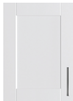
CABINETS Elkins White