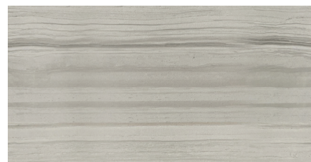
PRIMARY BATH WALL TILE Elysian Gentle Breeze EL26 | 12" x 24" Install: Staggered 70/30 CBP Greystone/Mapei Pewter