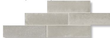
KITCHEN BACKSPLASH Conrad Brick Linen CB91 | 2" x 8"