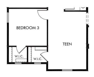
OPT. TEEN ROOM