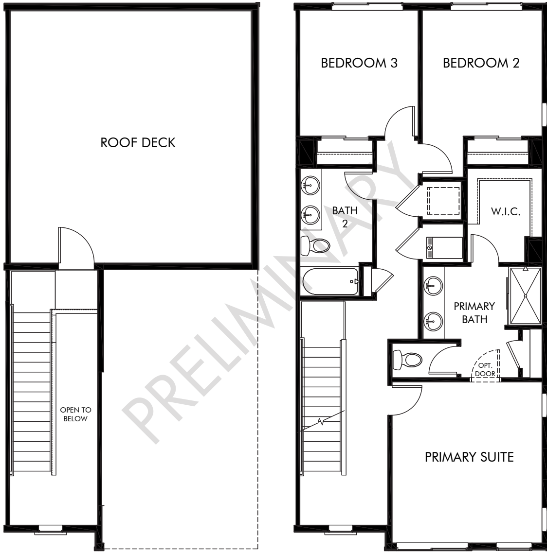
OPT. ROOF DECK