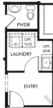
OPT. POWDER BATH