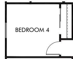
OPT. BEDROOM 4