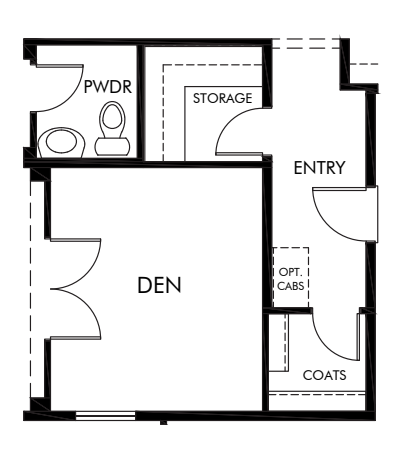
OPT. DOORS AT DEN