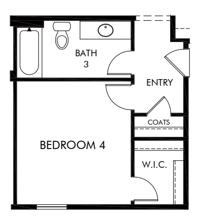
OPT. BEDROOM 4 & BATH 3 ILO DEN

Houghton Reserve - Promenade | Travertine/Plan 150.2580 | Options Approx. 2,588 sq. ft. | 3 Bed | 2.5 Bath | 3 Car Tandem Garage | 1 Story