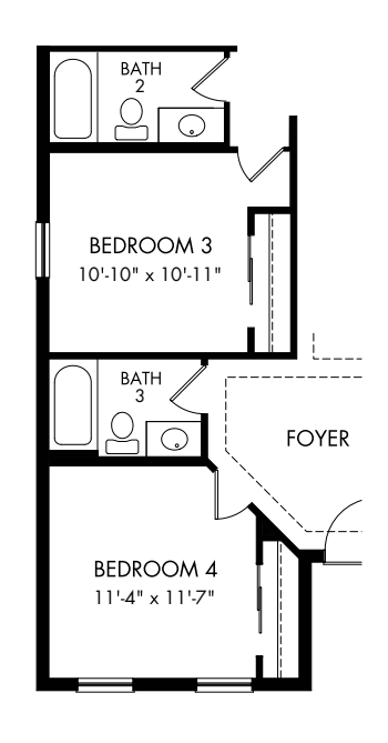
OPT. BEDROOM 4