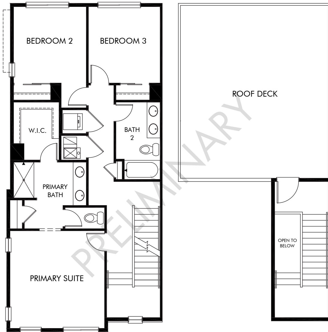
OPT. ROOF DECK