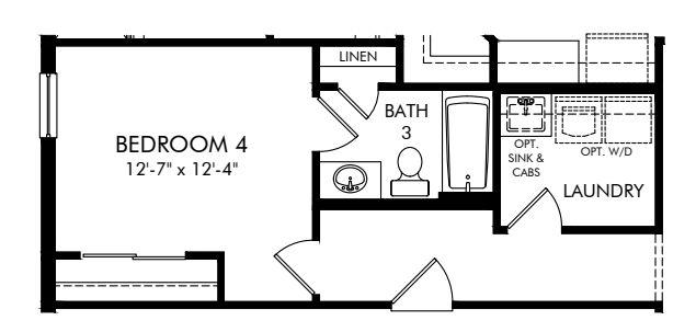
OPT. BEDROOM 4 & BATH 3