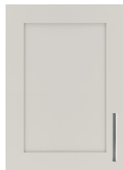
CABINETS Elkins Frost