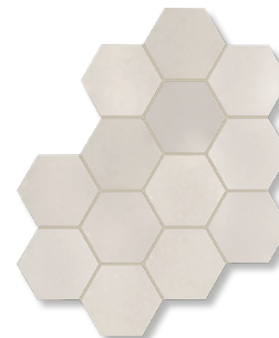
KITCHEN BACKSPLASH Mesmerist Spirit Hexagon MM30 | 4" x 4"