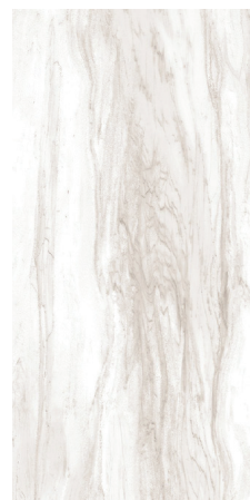
PRIMARY BATH WALL TILE Costar Calacatta Sky CT75 | 12" x 24" Install: Staggered 70/30 Grout: CBP Bleached Wood/Mapei Frost